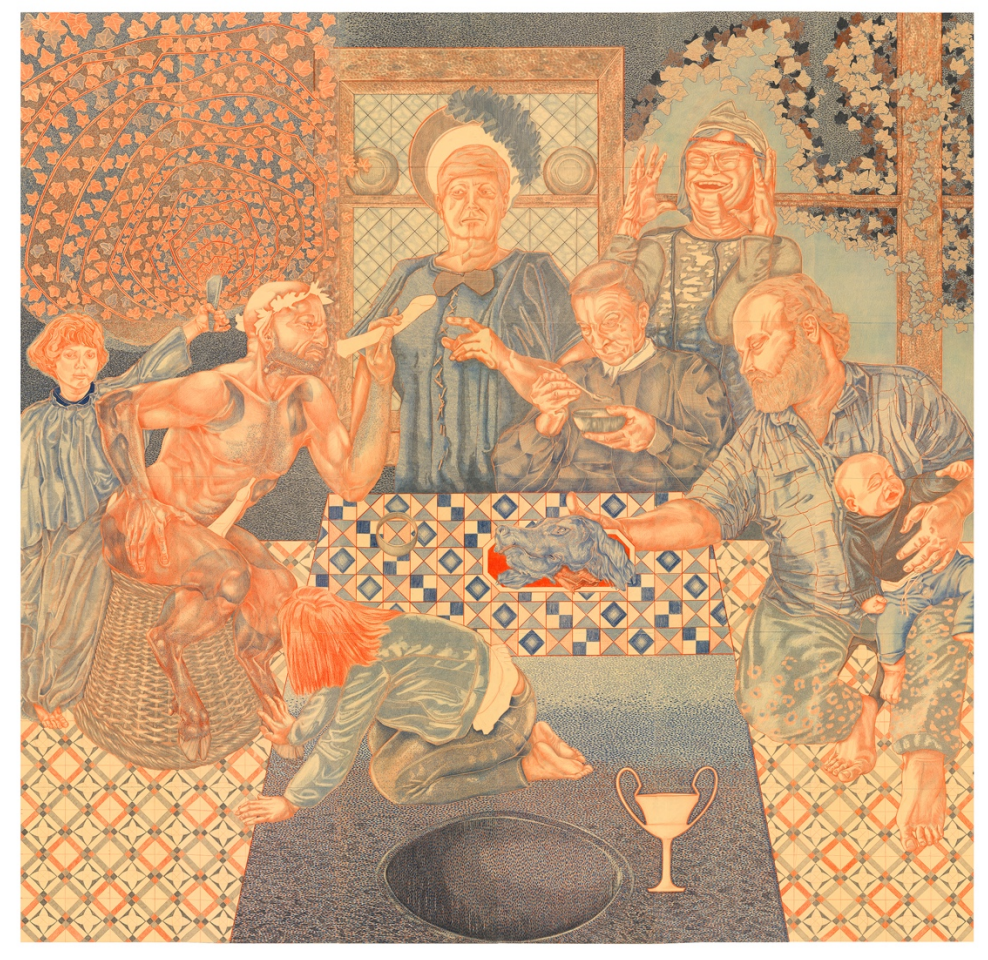
'Cosmogonical Treat' by Peter Depelchin, 2023, red and blue colour pencil and pencil on CIAT paper, 176x180 cm

Husk Gallery is delighted to present "Cosmogonical Treat", Peter Depelchin's third solo show in its gallery space in Rivoli Brussels. His exhibition offers itself as an ouroboros (the ancient symbol of the snake biting its tail); without beginning nor end. However, as the title indicates, the expo is also a treat, specifically a treat of a cosmogony. A cosmogony is a model, a fit that serves as an explanation for the origin and development of the universe. Depelchin approaches his cosmogony from both a mythological perspective and an astrophysical one. In other words, the treat is a newly formulated origin story on the one hand and a suggestive visualization of the latest theories in relation to the origin and structure formation of our universe on the other.