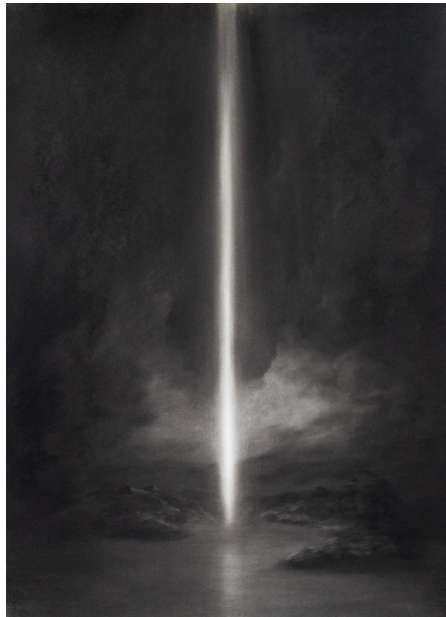
Kevin Vanwongerghem, Phenomenon series - Luminous Display #13 , 2023, charcoal on Hahnemühle paper, 104,5 x 76 cm

Belgian artist Kevin Vanwongerghem (b1984, Ghent) creates drawings that evoke an imaginary world in which landscape elements form the building blocks for fictional, sometimes surreal settings. Each landscape lacks human presence and goes beyond the pure representation of a setting. His current sources of inspiration are the relationship between culture and nature, along with religion and science. Triggered by what lies in the twilight zone between the mystical and explicable, Kevin Vanwongerghem explores how humans still need magic and wonder in postmodern times of demythologisation.