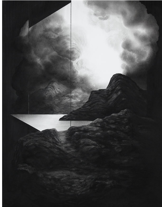
'Construction Series 2306' by Kevin Vanwonderghem, 2023, charcoal on Hahnemühle paper, 151x120cm

Kevin Vanwonderghem's drawings evoke an imaginary world in which landscape elements form the building blocks for fictional, sometimes surreal settings. Each landscape lacks human presence and goes beyond the pure representation of a setting. His current sources of inspiration are the relationship between culture and nature, along with religion and science. Triggered by what lies in the twilight zone between the mystical and explicable, Kevin Vanwonderghem explores how humans still need magic and wonder in postmodern times of demythologisation.