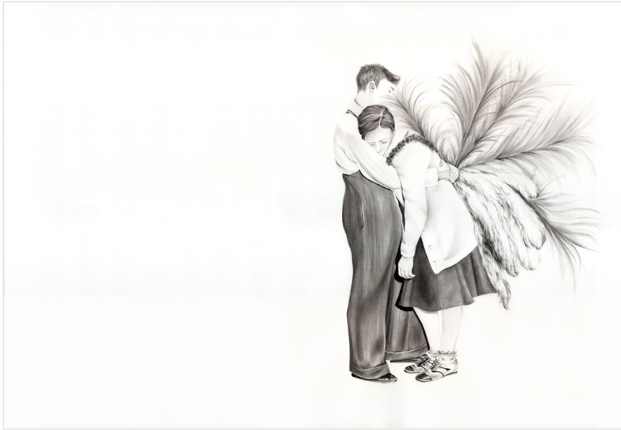
'Minuit suspendu #4' by Céline Marin, 2024, pencil on paper, 75x110cm

In Céline Marin's work, reality gives way to imagination. Her meticulously executed pencil drawings evoke a surreal world full of humour. The artist constructs her unique iconography by collecting amateur and personal snapshots, postcards, images cut out from magazines, old engravings, illustrated scientific articles and practical guides. She classifies and orders them according to broad themes, before assembling them. The act of assembling/dismantling and combining/uncombining is reminiscent of Surrealist collages. In all cases, iconographic research appears to be a way of breaking with the linear reading of history, preferring a diachronic and personal apprehension of it, giving rise to infinite combinations of the past with the present. In this clash, Céline Marin keeps the images that have an unusual character. Completely disparate things can be brought together by sharing a common space. The result is scenes filled with small characters without context, so that everyone can project their own mental landscape onto them. Céline Marin is inspired by her observation of a vast sociocultural heterogeneity, and plays on the unusual to present a collection of bizarre tribes.